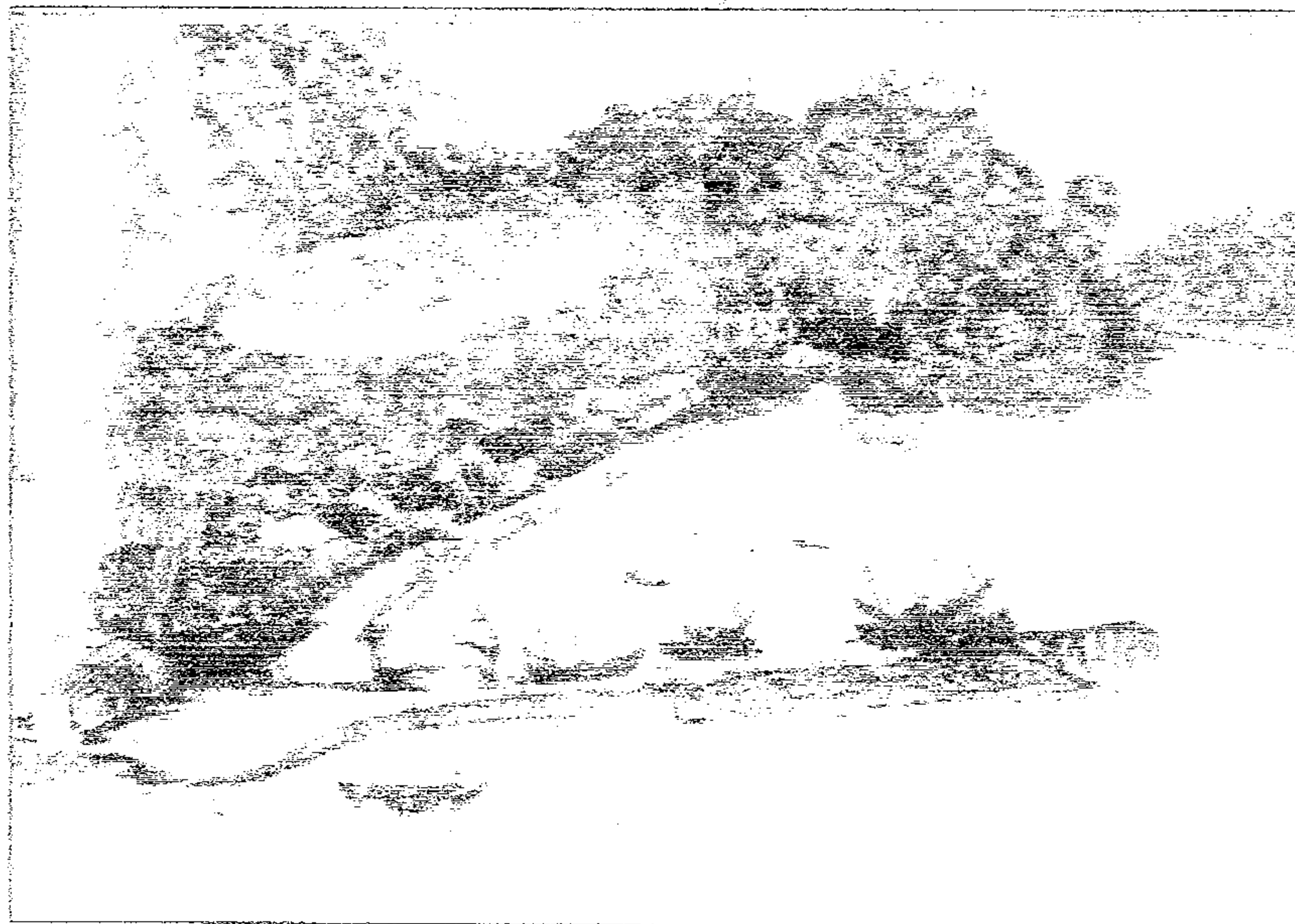
THIS PAINTING OF VICTORIA POINT, BURMA WAS DONE BY AN UNKNOWN POW